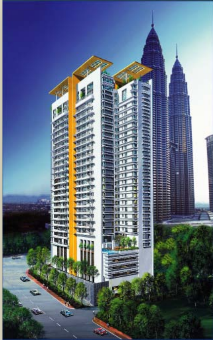
Walking distance from the Petronas Twin Towers!